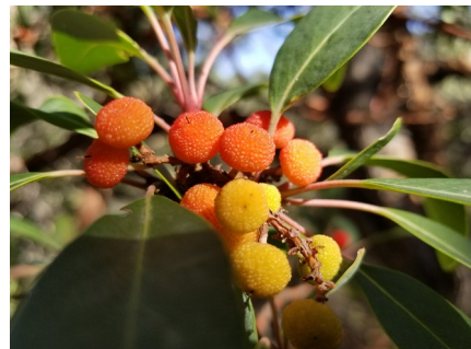
Arizona madrone ( Arbutus arizonica )