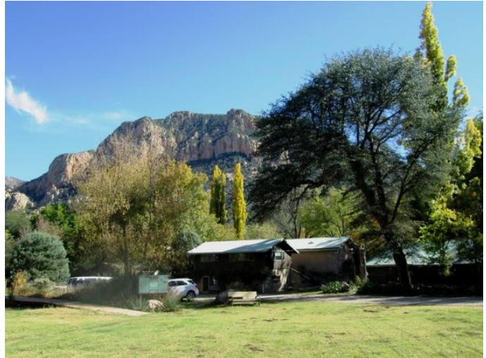
The Southwestern Research Station