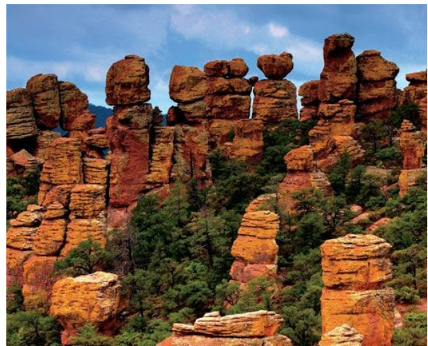
The Chiricahua Monument