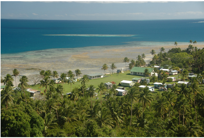
View of Natokalau Village and tabu area in Kubulau.

were still declining and the chiefs sought external assistance with management. The Bua Provincial Office directed the Bose Vanua to consult with non-governmental organizations (NGOs) – including Wildlife Conservation Society (WCS), WWF South Pacific Program, Wetlands International (Oceania), and the Coral Reef Alliance – for support with broader ecosystem management.