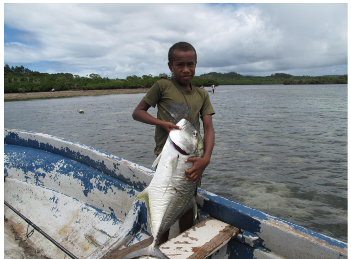
Kubulau youth with giant trevally.

The area rebounded quickly, as demonstrated by perceptions of resource availability and underwater surveys, as protection measures helped reverse the fisheries depletion. As of 2014, the marine ecosystem remained relatively intact, and outer reef areas, in particular, supported high fish biomass and catch rates, though the entire