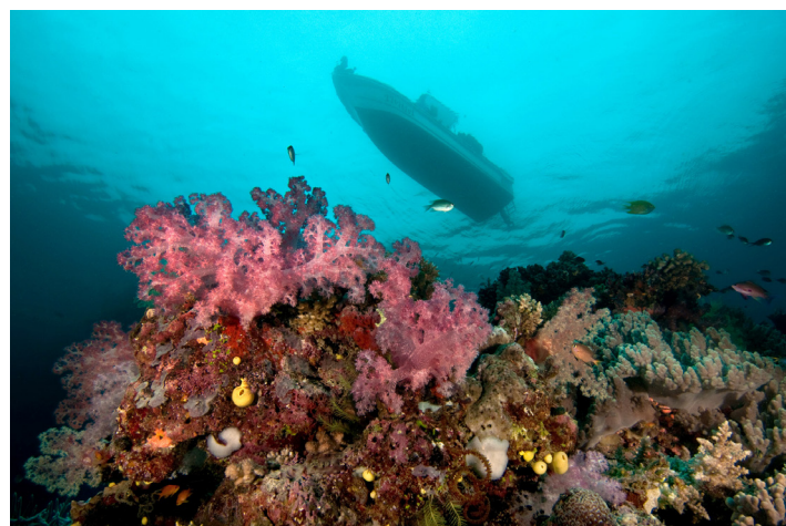
Namena Marine Reserve.

quickly realized that the representatives did not convey this information effectively to villagers, creating confusion and misunderstandings. WCS worked with SeaWeb Asia-Pacific to train local community facilitators to be better communicators of information to inform resource management decisions. WCS is now working to develop similar programs in other parts of Fiji, starting at the village level to ensure increased participation and awareness.